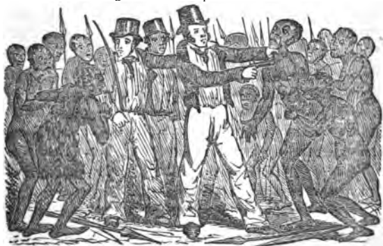
Thompson slaying the Natives.

the only weapon he would employ against them, succeeded in killing seven stout fellows who came to attack him, an act which obtained him great credit with Maquina and the chiefs, who after this, held him in much higher estimation, and gave him the appellation of Chehiel-suma-har , it being the name of a very celebrated warrior of their nation in ancient times, whose exploits were the constant theme of their praise.